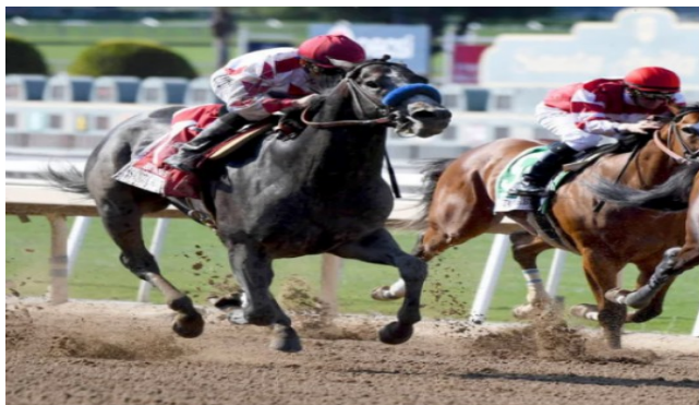
EXPERT HORSE RACING HANDICAPPING!

The Trackpro handicapping algorithm performs “ deep research ” on every contender in the race by performing what Trackpro calls “ Comprehensive Handicapping ”. There is no bias in the Trackpro Value Rating (TPV) algorithm. Every horse has some chance to win does it not? The answer is yes. So why toss any